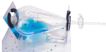
Separate Funnel Fixture