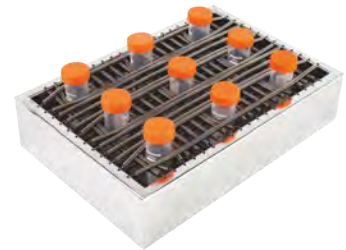
Mini Universal Spring Platform