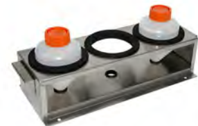
Bioreactor Tube Holder