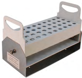
Adjustable Tube Racks