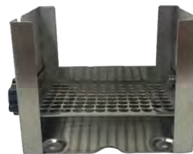
Multi Micro-Plate holder