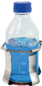
Infusion Bottle Clamp