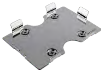
96-Well Micro-Plate Holder